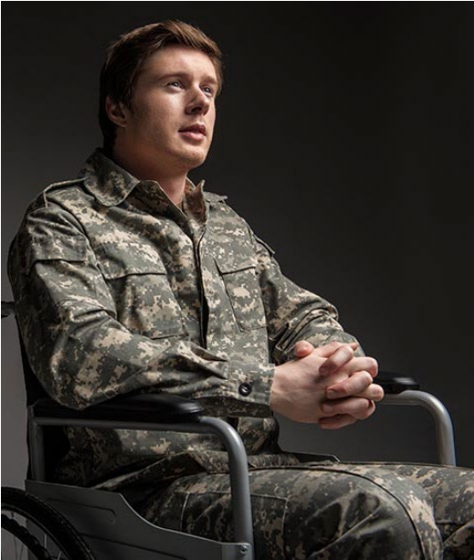
2 units for Veterans