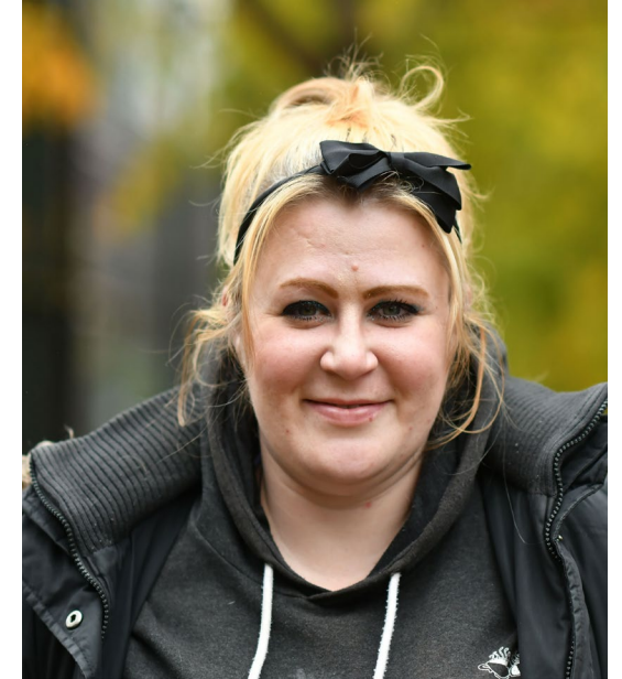
8 units for Individuals