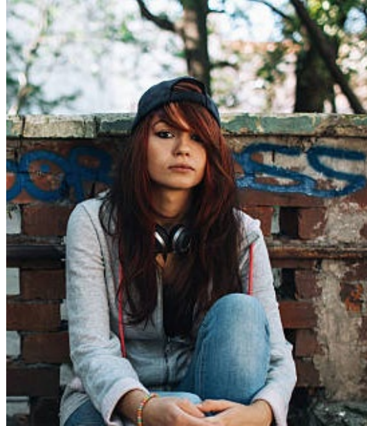
2 units for Transition Aged Youth