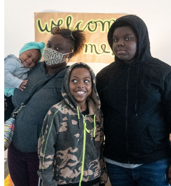
4 units for Families